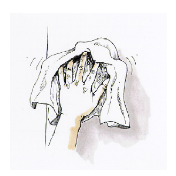
Apply at temperature range +15°C to +25°C (+60°F to +77°F). Surfaces should be clean and dry, free of dust, grease, oil and any other loose matter. Do not use degreasing products. Not for use in application likely to make contact with chlorinated, cetonic or esther solvents.