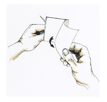
Remove the protective release paper taking care not to touch the adhesive