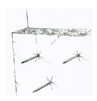
Insulation can be impaled immediately but maximum strength of adherence is achieved after 24 hours.