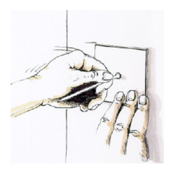
Place the hanger in the required position and press the base against the surface to be insulated